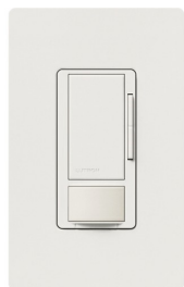
Maestro Sensor Switches