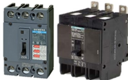
General Purpose Breakers