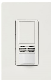
Maestro Dual Technology Sensor Switch