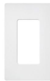
Claro- style Wallplate