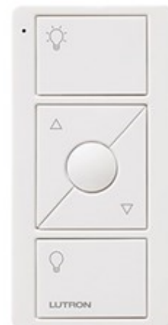
Pico 3-button with raise/lower Wireless Remote