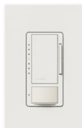
Maestro Sensor Dimmers